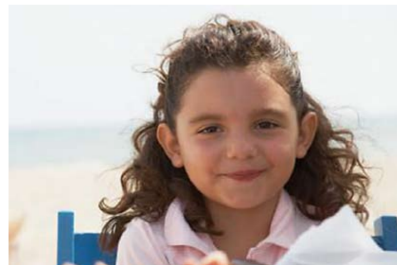
Girl: "I can do that!"