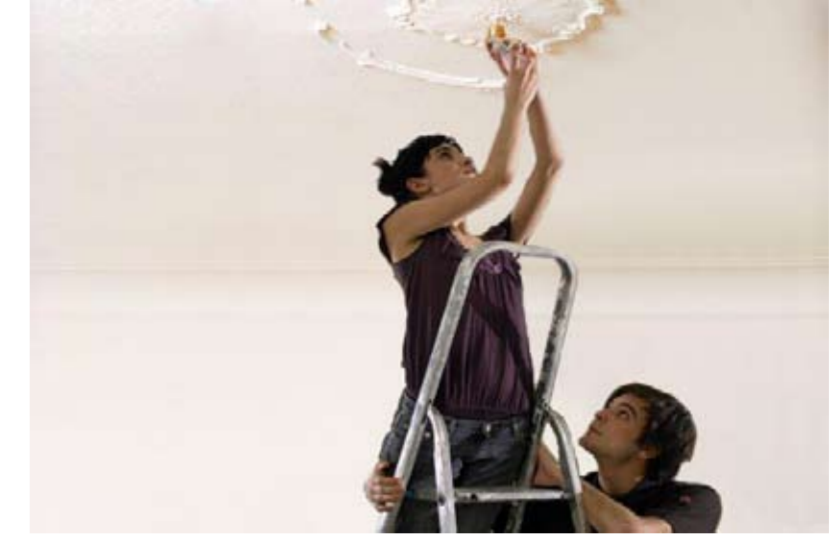
Man: "I don't know much about clean coal, but change to energy efficient light bulbs? I can do that."