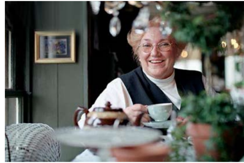
Old lady: "I can't help geothermaging, but only boil the water I need? I can do that."