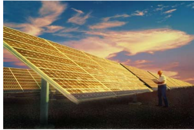
MVO: "Climate change affects us all. That's why the government is investing over 2.8 billion dollars to tackle the problem, including the development of new sources of energy."