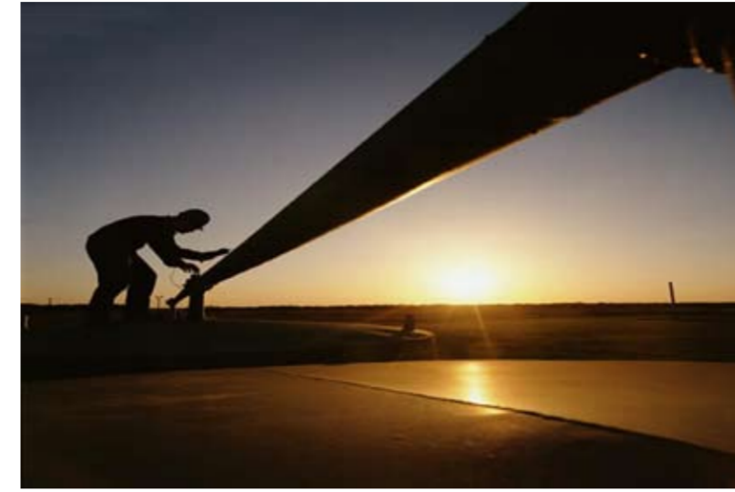
MVO: "We've developed new ways to make coal cleaner."