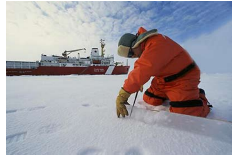
MVO: "And we're supporting scientific research to find better solutions to climate change – for now and into the future."