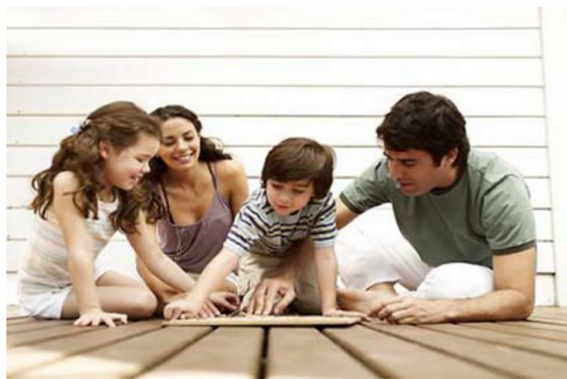
Man: "Walk the kids to school? I can do that."