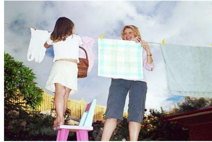
Woman: "I can't build a solar plant, but use the sun instead of my dryer? I can do that."