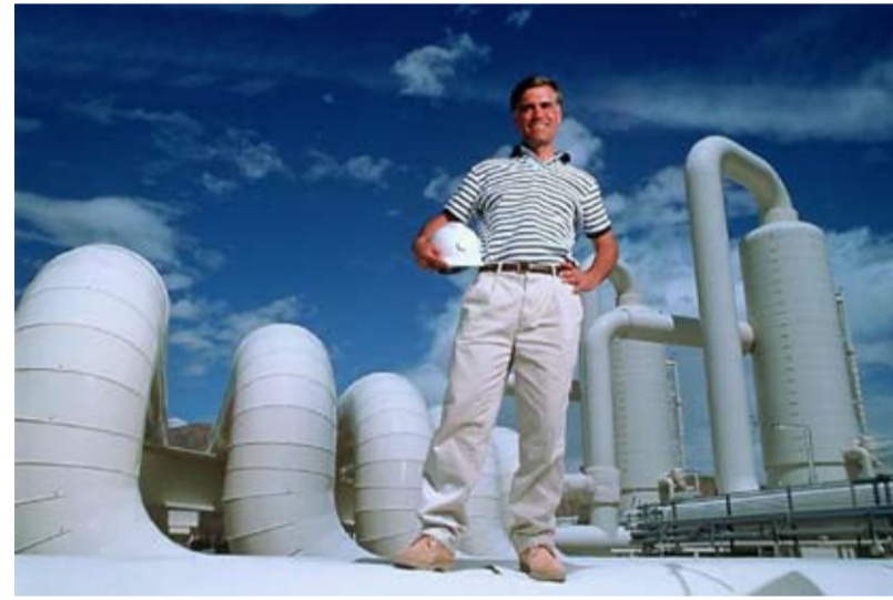
MVO: "We're supporting new clean power stations that use geothermal heat from deep down in the Earth's crust."